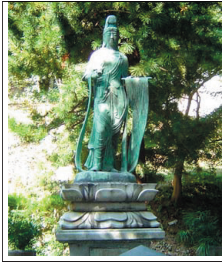
Ten Verse Long Life Kannon Sutra