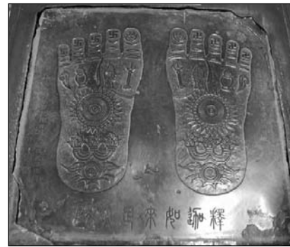
Stele in the shape of the Buddha's foot print (Buddhapada) at Big Wild Goose Pagoda in Xi'an, China

1. "Buddhapada: The Buddha's Footprint." www.religionfacts.com Accessed May 2009.