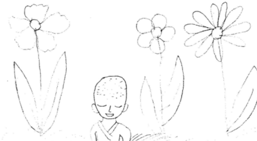
Summer Time Buddha

When coming to the new zendo please park on Kingswood in front of the house. If that area is full, start parking on either side of Brookwood directly adjacent to the house. For the time being we will be entering through the sliding glass door around the back. Come through the gate in the fence and leave your shoes outside. If you are late or arrive during a service it is ok to quietly enter the zendo and find a place. Remember it is important that we arrive early so that we are actually starting at the scheduled time.